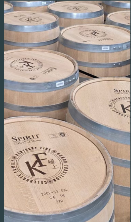
Contract produced barrels destined for Japan. SKD can produce distillate for any Mash Bill.

The Wholesale Market is cyclical and offers periods of high value. It is 100% the decision of the investor where and when to sell their barrels. If the wholesale market outpaces SKD, the investor may sell their barrels to another brand with or without a broker.